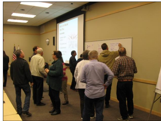
Participants choose their top community priorities at the community input meeting in October 2015.

To provide the citizens of Washington County with meaningful input into the site prioritization process and to provide information on the program, the PMT hosted a community input meeting in October. The meeting provided an overview of the program, long term benefits for the County, and gathered input on the community's priorities for the program. During the meeting small groups collaborated to discuss and