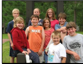
Washington County Kids at Sand Lake!

Students entering grades 6-8 in the fall who have an interest in the outdoors are encouraged to attend. Wisconsin and UP Michigan residents are welcome.