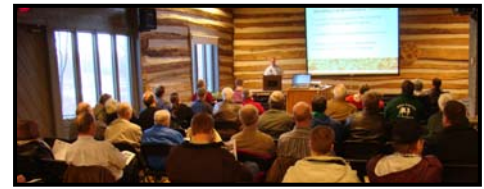
A joint workshop with DATCP and staff from Washington and Ozaukee Counties was held at Riveredge Nature Center on March 25, 2010 for local officials.

A countywide open house and public hearing was held at the Washington County Fair Park Pavilion on October 24, 2011 to solicit public comment regarding the farmland preservation plan.