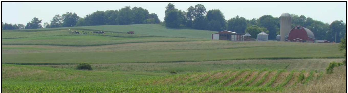
The Working Lands Initiative (WLI) was created to protect the best agricultural lands from non-agricultural development and ensure agriculture remains a strong aspect of Wisconsin's economy.