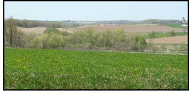
Washington County's 1981 Farmland Preservation Plan defined farmland preservation areas as contiguous blocks of farmland at least 640 acres in size that were relatively uninterrupted by conflicting uses, with at least 50 percent of the soil identified as "Prime Farmland".

Farmland Preservation Areas were identified by Washington County's 1981 Farmland Preservation Plan. The plan defined farmland preservation areas as contiguous blocks of farmland at least 640 acres in size that were relatively uninterrupted by conflicting uses, with at least 50 percent of the soils on each farm meeting Soil Conservation Service (now the USDA Natural Resources Conservation Service) criteria as "Prime Farmland" or "Farmland of Statewide Importance." Prime agricultural lands are those lands which, in terms of farm size, the aggregate area being farmed, and soil characteristics, are best suited for the production of food and fiber. Generally, prime farmlands are Class I or II soils and farmlands of statewide importance are Class III soils.