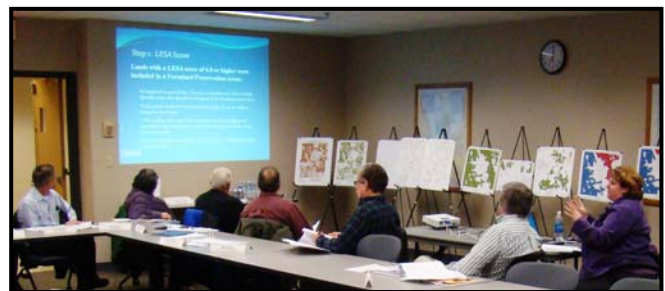
A Farmland Preservation Plan Advisory Committee (FPPAC) was formed to guide development of the Farmland Preservation Plan.

During the summer of 2010, Washington County staff attended Plan Commission and/or Board meetings in all Towns in Washington County and also the Villages of Richfield and Germantown to present an overview of the Working Lands Initiative and the County’s plan of action to develop its farmland preservation plan. All cities, villages, and towns within the County were invited to appoint a representative to serve on the Advisory Committee. Members of the Advisory Committee are listed in the front of this report.