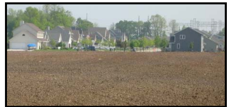
One of the goals of the WLI is to maintain large areas of contiguous land primarily in agricultural use and to reduce land use conflicts through Agricultural Enterprise Areas.