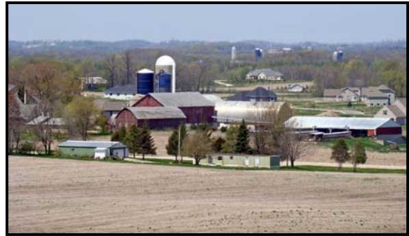
Farmland has been threatened by rapid conversion of agricultural land to development to accommodate population growth.

Wisconsin-Extension based on data for 2007. Over recent decades, Wisconsin's working lands have been threatened by the pace and the fragmented fashion that farmland has been converted to other forms of development, often referred to as "sprawl," as local governments approve subdivision plats according to their land use plans and comprehensive plans to accommodate a growing population. Recognizing that housing development is needed as populations increase, the Working Lands Initiative (WLI) was created to protect the best agricultural lands from non-agricultural development and ensure agriculture remains a strong aspect of Wisconsin's economy, while encouraging strategies to increase housing density in areas outside of the farmland preservation areas.