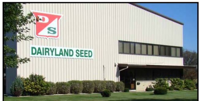
In 2007, Wisconsin's farms and agricultural businesses generated $59.16 billion in economic activity and provided jobs for 353,991 people.

The preservation of Wisconsin's working lands is critical for the health and success of the State and its residents. These lands provide homes for people, flora, and fauna, and produce food, fiber, and sources of biomass for fuels and energy. Preservation of this resource base is vital for the future of agriculture, the health of our environment, and to sustain a healthy economy in Wisconsin. Wisconsin's farms and agricultural businesses generate $59.16 billion in economic activity and provide jobs for 353,991 people, according to a recent study conducted by University of