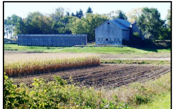
Wisconsin's original Farmland Preservation Program was enacted in 1977 and Washington County's Farmland Preservation Plan was adopted by the Washington County Board of Supervisors and certified in 1981.

Enacted in 1977, the original Wisconsin Farmland Preservation Program was designed to preserve Wisconsin farmland by means of local land use planning and soil conservation practices and to provide property tax relief to eligible farmland owners. The program was administered by County and local governments, but the Wisconsin Land and Water Conservation Board (LWCB) had to first certify that the County farmland preservation plan met the standards specified in Chapter 91 of the Wisconsin Statutes . Of the 72 counties in Wisconsin, 70 have certified farmland preservation plans. Washington County's Farmland Preservation Plan was adopted by the Washington County Board and certified in 1981.