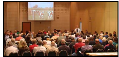
An overview of the Working Lands Initiative and planning process was presented at Washington County Fair Park on June 29, 2010.