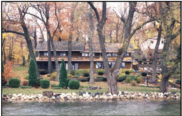
Washington County should continue to implement the Washington County Shoreland, Wetland, and Floodplain Zoning Ordinance to help protect County residents from flooding hazards.